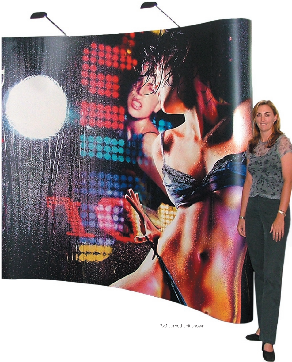
3x3 curved unit shown